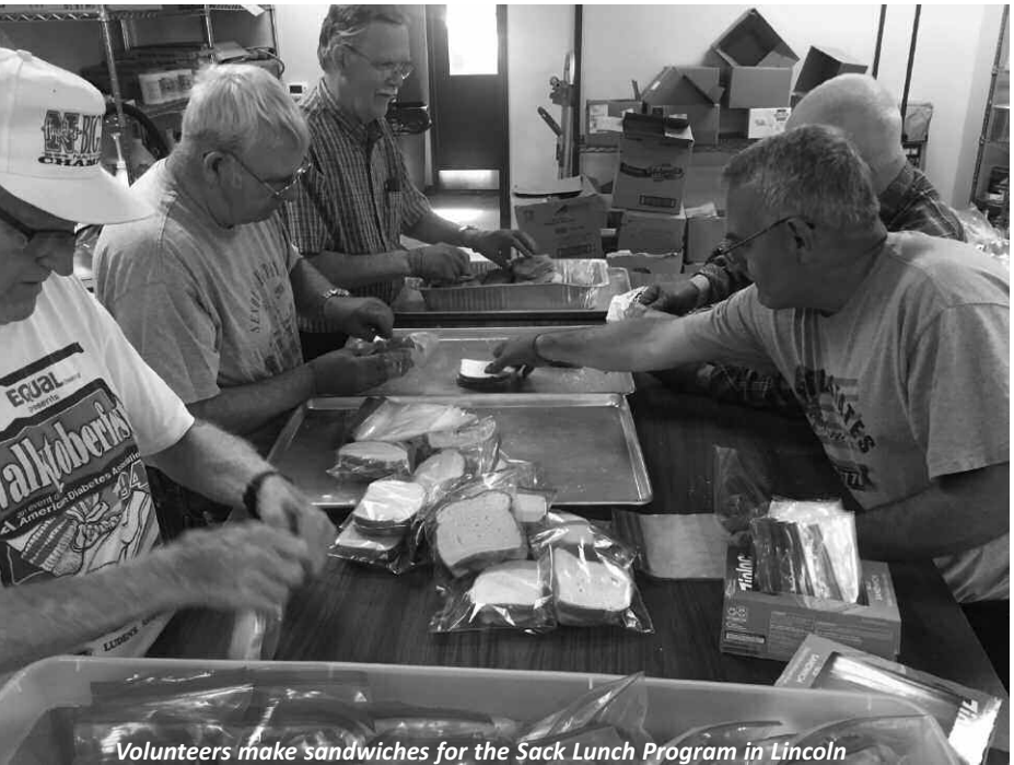
Volunteers make sandwiches for the Sack Lunch Program in Lincoln

If you are interested in volunteering, in the Hastings area contact Jill McMahon at (402) 463-2112 or (888) 826-9629. In the Lincoln area, contact Sarah Huebner at (402) 474-1600 or (800) 981-8242. Or visit our website at www.cssisus.org .