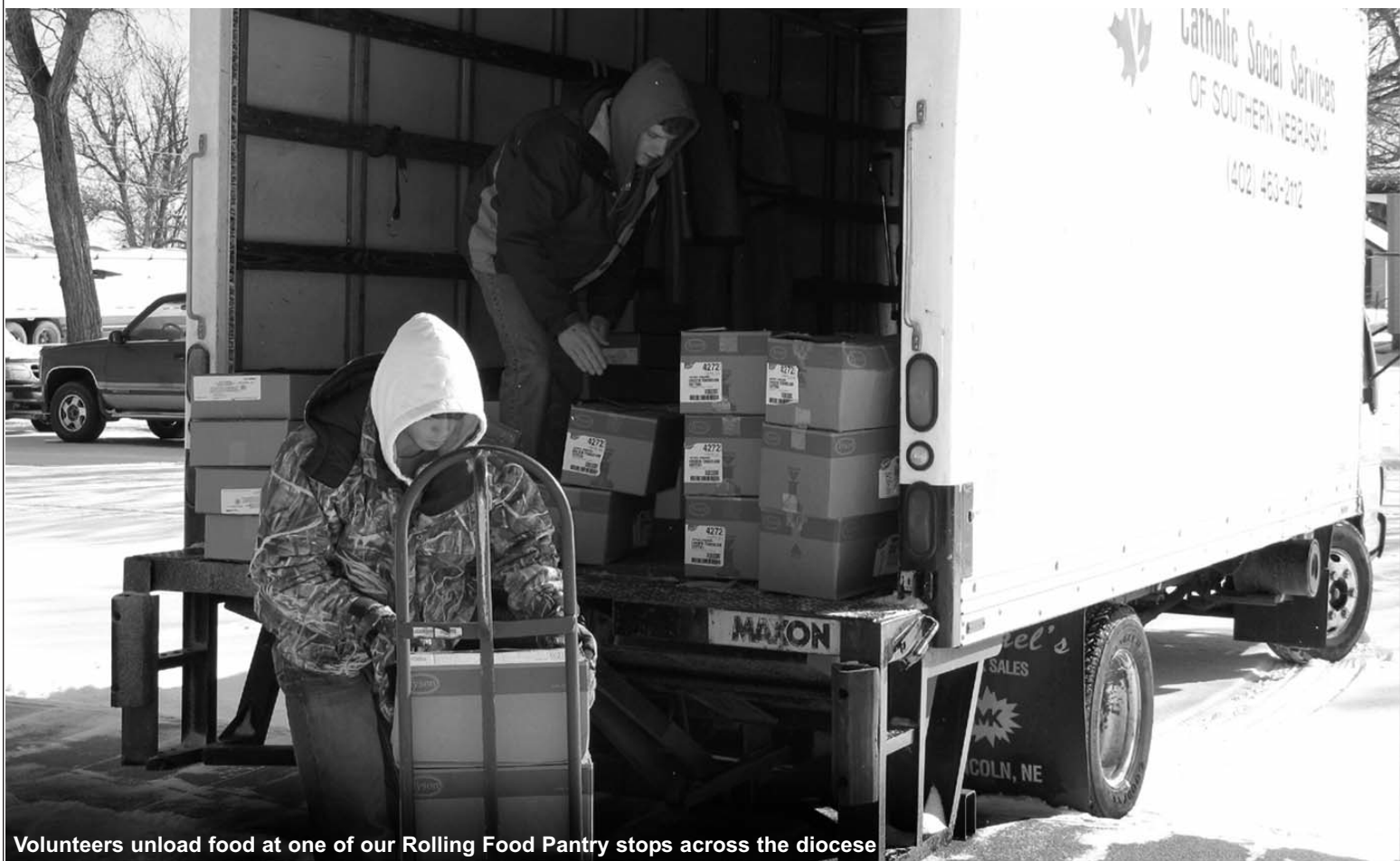
Volunteers unload food at one of our Rolling Food Pantry stops across the diocese