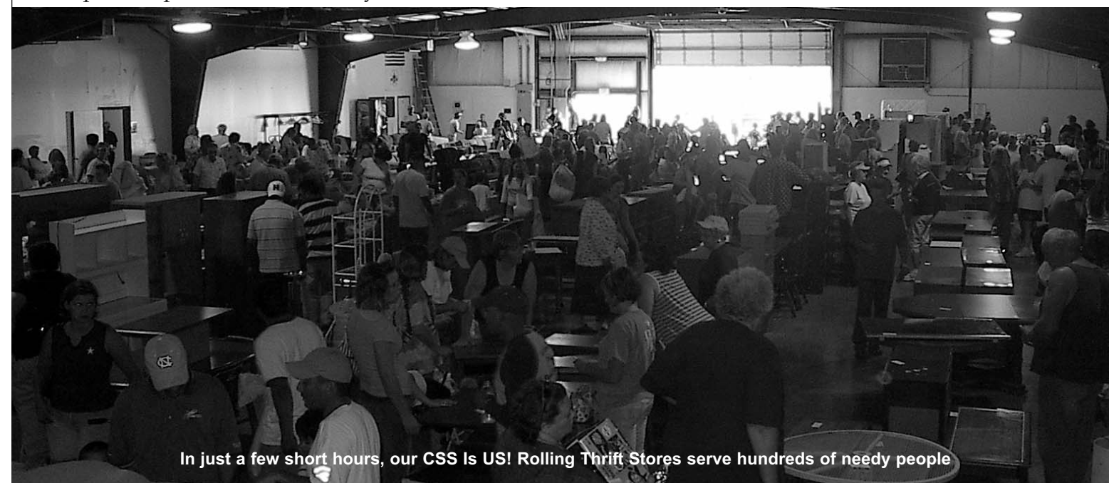
In just a few short hours, our CSS Is US! Rolling Thrift Stores serve hundreds of needy people

___ Yes, I would like to be a member of Via Satoris