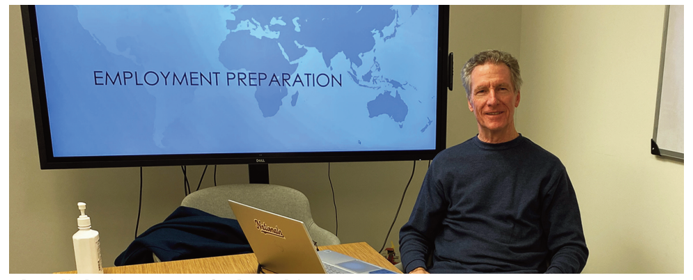
The Flight into Egypt/John White